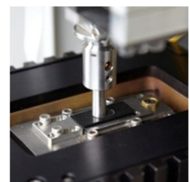
*Vibration wear test against 100 Cr6 steel